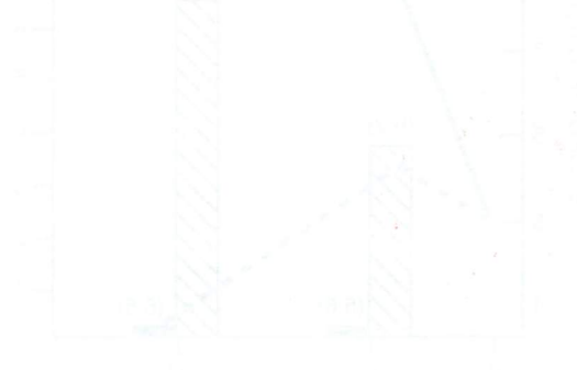
Fig. 1. Relationship between cecal size and bacterial populations in mice. The x-axis represents cecal size (mm) and the y-axis represents bacterial populations (log CFU/g). The solid line shows the relationship in conventional mice, and the dashed line shows the relationship in gnotobiotic mice.

the cecal size and the consistency of cecal contents in the chicken. Jpn J Microbiol 1976; 20 : 197-202. 18. Morishita Y, Ozaki A, Yamamoto T, Mitsuoka T. [Reduction in cecal size and E. coli and enterococcal populations of gnotobiotic mice by chloroform-resistant bacteria from the cecum of conventional mice.] Nippon Saikingaku Zasshi 1980; 35 : 431-432 [in Japanese]. 19. van der Waaij D, Berghuis-de Vries JM, Lekkerkerk-van der